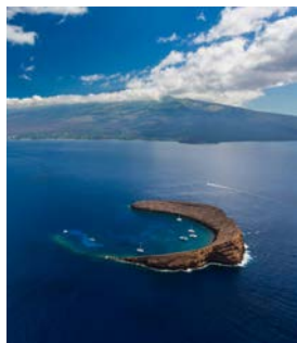
Maui | Discover Molokini