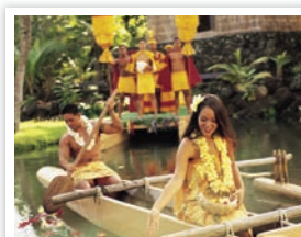
Oahu | Polynesian Cultural Center