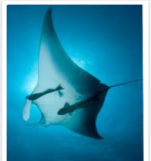
Island of Hawaii | Manta Ray Adventure