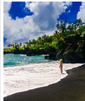
Maui | Hana Private Experience