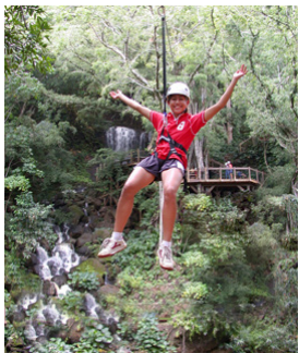
Kauai | Kipu Falls Zipline Safari

Here is a small sample of the many activities our Destination Specialists can pre-book for you. Scan the QR code or visit Journese.com/experiences for a complete list of excursions, pricing and descriptions.