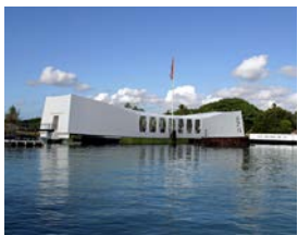
Oahu | Pearl Harbor, Arizona & Punchbowl