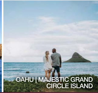
OAHU | MAJESTIC GRAND CIRCLE ISLAND