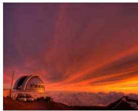
Island of Hawaii | Mauna Kea Sunset & Stargazing