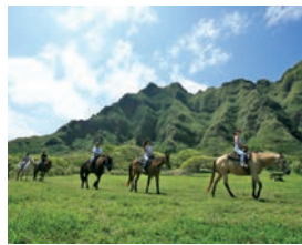
Oahu | Kula Ranch Horseback Adventure