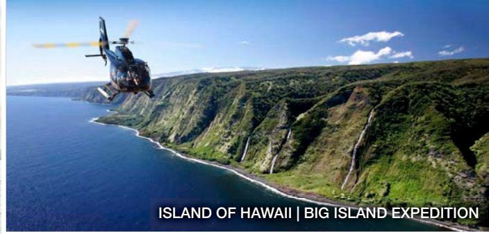
ISLAND OF HAWAII | BIG ISLAND EXPEDITION