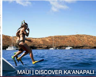
MAUI | DISCOVER KA'ANAPALI