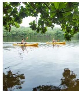
Kauai | Paddle, Jungle, Stream & Waterfall