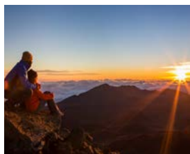
Haleakala Sunrise or Sunset Excursion