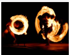
Authentic Polynesian Luau