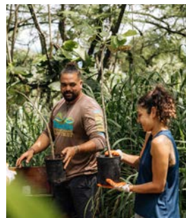
Ask about Hands on Maui Volunteer Experiences