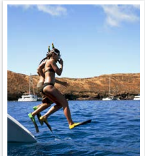
Kayak & Snorkel Adventure