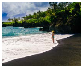
Road to Hana Sightseeing Experience