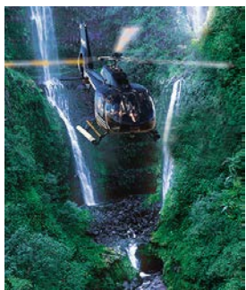
Maui Circle Island Deluxe Helicopter Adventure

For those interested in helping the community while visiting Maui, Hands on Maui lists opportunities for volunteer service, including food preparation and distribution, natural resource maintenance and animal care.