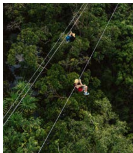
Kaanapali or Haleakala Zipline Excursion