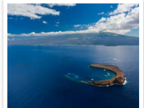
Discover Molokini & Turtle Town Snorkel