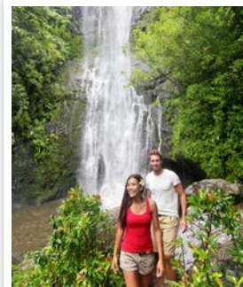
East Maui Waterfalls & Rainforest Hike