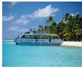
Aitutaki | One Foot Island Bishop Cruise