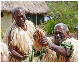
Nadi | Vuda Lookout Excursion