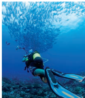
Tahiti | Introduction or Advanced Scuba Diving