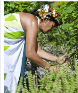
Taha'a | Mahana Moe Moea