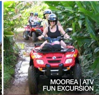
MOOREA | ATV FUN EXCURSION