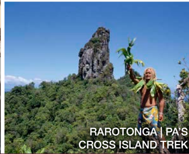
RAROTONGA | PA'S CROSS ISLAND TREK