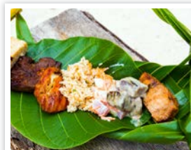
Moorea | Moorea Food Experience