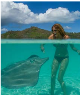
Bora Bora | Eco Shark & Ray Snorkel Safari

Here is a small sample of the many activities our Destination Specialists can pre-book for you. Scan the QR code or visit Journese.com/experiences for a complete list of excursions, pricing and descriptions.