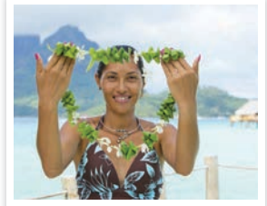
Tahiti | Arrival Services & Lounge access