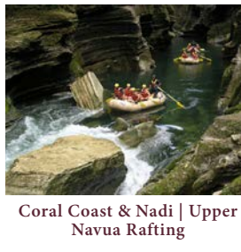
Coral Coast & Nadi | Upper Navua Rafting