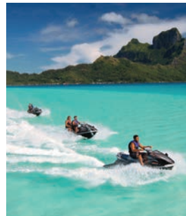
Bora Bora | Combination Jet Ski & 4x4 Safari