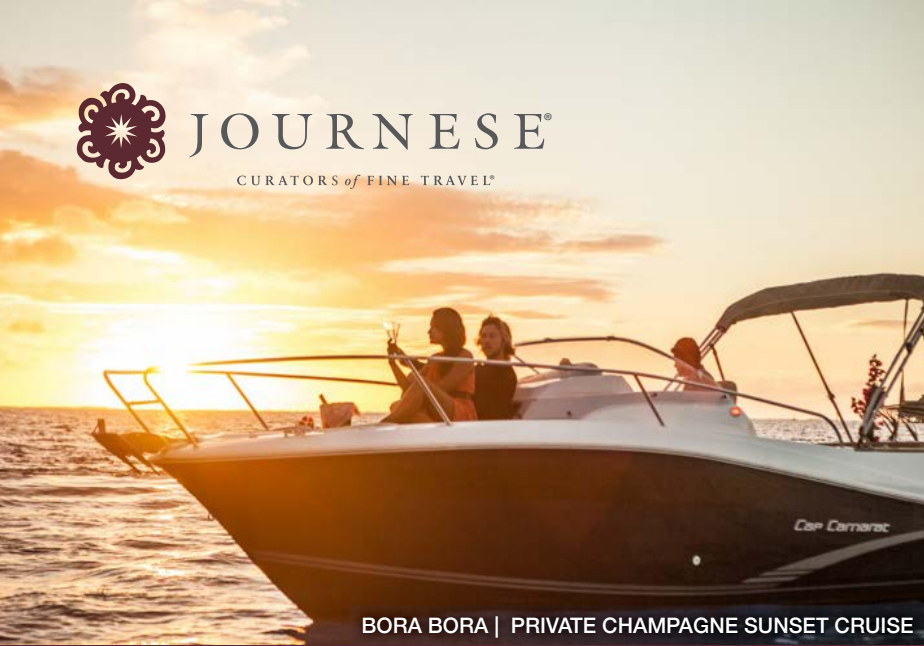
BORA BORA | PRIVATE CHAMPAGNE SUNSET CRUISE