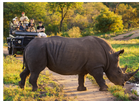
Embark on a once-in-a-lifetime safari at Kruger National Park

Fondly known as the “Rainbow Nation” by the locals, explore the southern most country of Africa, where colonial roots and gold rush days meet contemporary, culture-packed cities and trendy urban towns, fertile ecosystems and picturesque topography, big game adventures and lively beaches set along two oceans. Discover more than a dozen luxurious hotels and resorts across Cape Town and Johannesburg featuring culinary excellence, celebrated wine cellars, premier experiences and signature services. Journese® can handcraft every aspect of your vacation from all classes of air service, in-destination airfare, private transfers and engaging activities including private options and two-night mini packages, allowing travelers inspiring possibilities to explore these fascinating cities and countrysides.