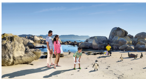
Walk with the penguins on Boulders Beach