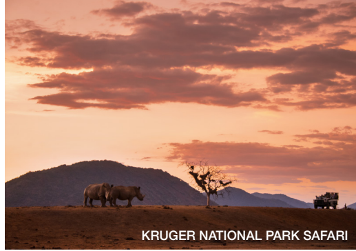
KRUGER NATIONAL PARK SAFARI