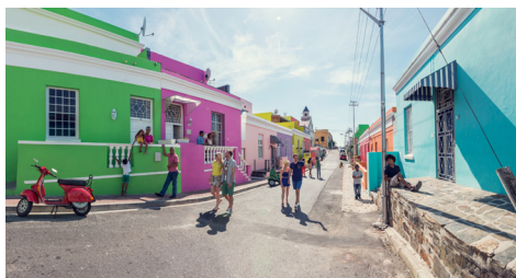
Discover the colorful homes and culture of the Bo-Kaap people of Cape Town