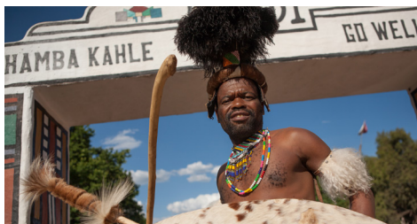
Learn about the Zulu warriors at the Lesedi Cultural Village