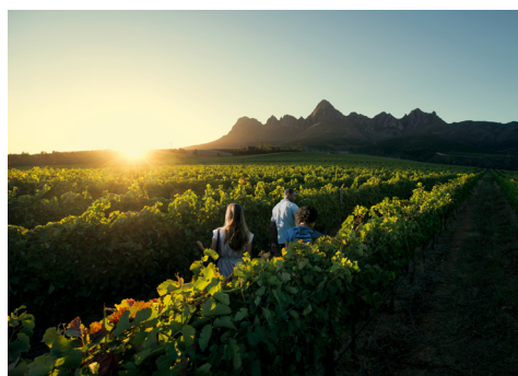
Savor the rich varietals on a Wineland Experience

CAPE TOWN & JOHANNESBURG: THE NEWEST ADDITIONS TO THE JOURNESE® PORTFOLIO