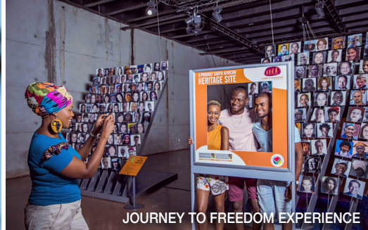
JOURNEY TO FREEDOM EXPERIENCE