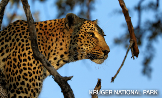
KRUGER NATIONAL PARK