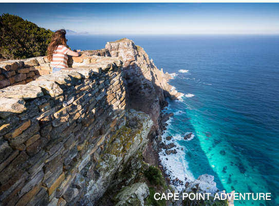
CAPE POINT ADVENTURE