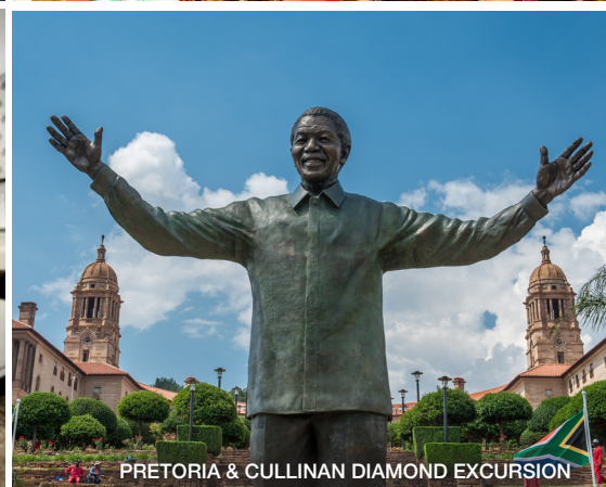
PRETORIA & CULLINAN DIAMOND EXCURSION