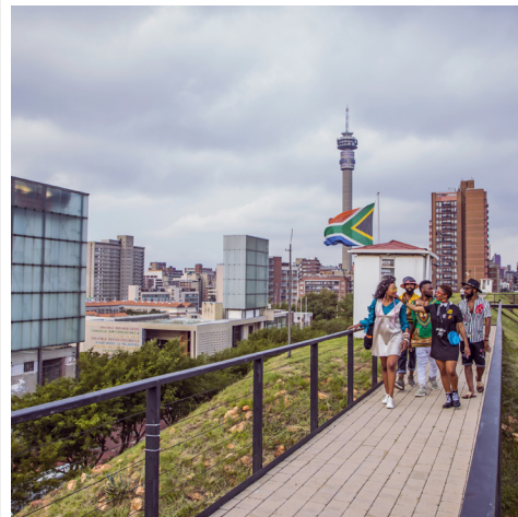
Explore the history and freedom journey in Johannesburg at Constitution Hill