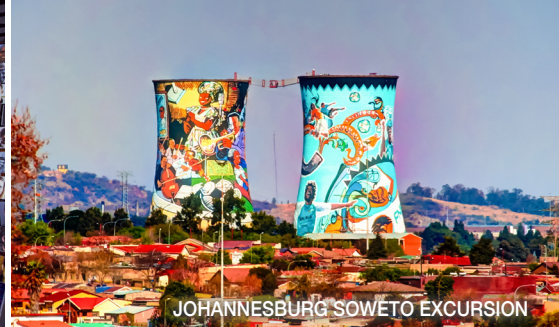
JOHANNESBURG SOWETO EXCURSION