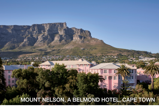
MOUNT NELSON, A BELMOND HOTEL, CAPE TOWN