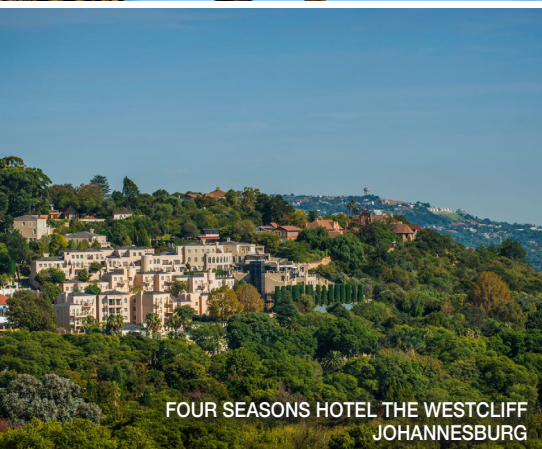
FOUR SEASONS HOTEL THE WESTCLIFF JOHANNESBURG