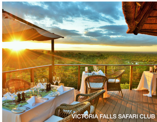
VICTORIA FALLS SAFARI CLUB