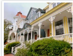
Georgia | Walking Savannah Exploration