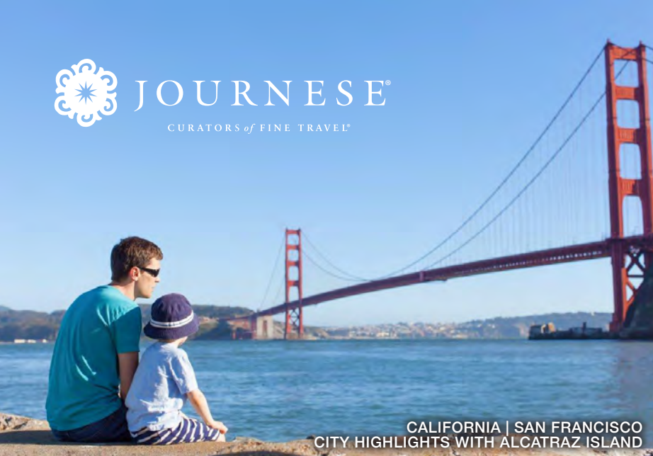
CALIFORNIA | SAN FRANCISCO CITY HIGHLIGHTS WITH ALCATRAZ ISLAND