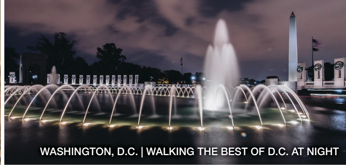
WASHINGTON, D.C. | WALKING THE BEST OF D.C. AT NIGHT