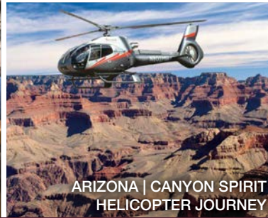
ARIZONA | CANYON SPIRIT HELICOPTER JOURNEY