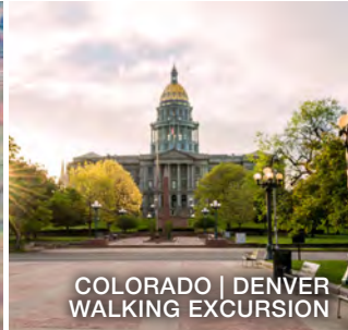
COLORADO | DENVER WALKING EXCURSION