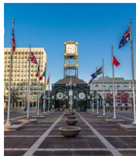
Tennessee | Discover Memphis Walking Excursion