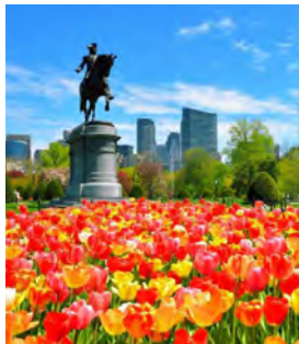
Massachusetts | Boston's Freedom Trail Experience