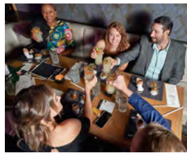
Nevada | Lip Smacking Foodie Tours: Savors of the Strip