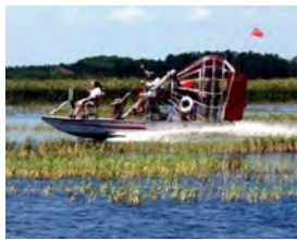
Florida | Miami Everglades Expedition