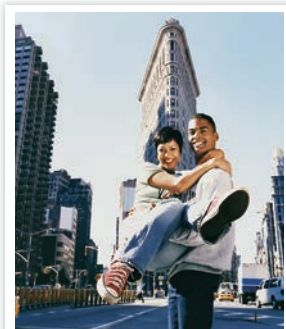
New York | Midtown Manhattan & The Empire State Building

Here is a small sample of the many activities our Destination Specialists can pre-book for your clients. Scan the QR code or visit Journese.com/experiences for a complete list of excursions, pricing and descriptions.