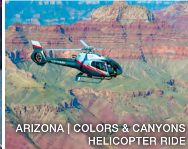
ARIZONA | COLORS & CANYONS HELICOPTER RIDE