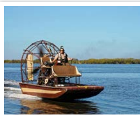
Florida | Mimi Everglades Expedition