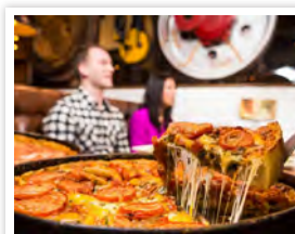
Illinois | Self-Guided Deep Dish Pizza Experience