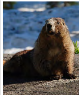
Washington | Olympic Mountain National Park