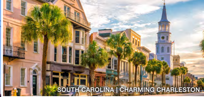
SOUTH CAROLINA | CHARMING CHARLESTON