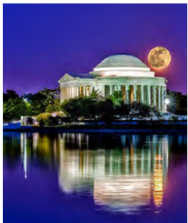
Washington, D.C. | The Best of D.C. at Night

Here is a small sample of the many activities our Destination Specialists can pre-book for your clients. Scan the QR code or visit Journese.com/experiences for a complete list of excursions, pricing and descriptions.