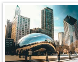
Illinois | Highlights of Chicago with Hancock Tower