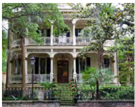
Georgia | Walking Savannah Exploration