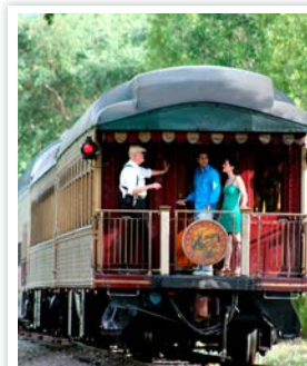
California | Napa Wine Train: Gourmet Express