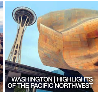
WASHINGTON | HIGHLIGHTS OF THE PACIFIC NORTHWEST