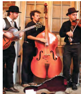
Louisiana | A Walk through New Orleans