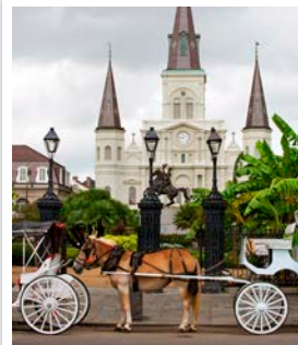
Louisiana | A Walk through New Orleans