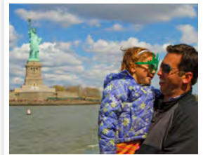
New York | Statue of Liberty & Ellis Island Experience