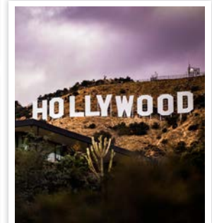
California | L.A.'s Iconic Movie Moments