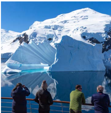
Embark on incredible excursions