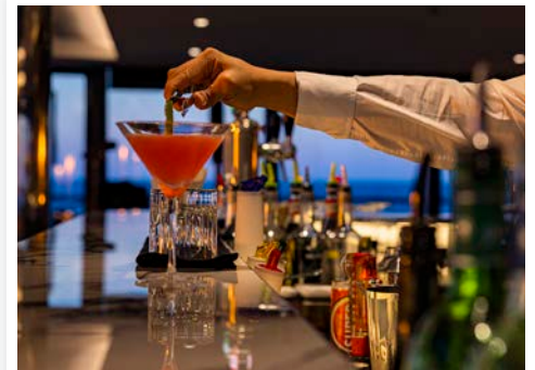
Toast with a crafted cocktail

Launching transcendent cruising excursions to unique places few have experienced, step aboard the intimate cutting-edge yachts of Atlas Ocean Voyages. Designed for environmentally conscious explorers who seek enlightenment, culture and adventure, unwind in spacious refined staterooms and butler suites, globally-inspired cuisine, wellness opportunities, and workshops together with world-class service from a high-staff-to-guest ratio. Discover extraordinary itineraries and bucket-list destinations stretching to the far reaches of the earth with three distinct expeditions, from curated epicurean and cultural journeys to the nether regions of the polar ice caps for one-of-a-kind moments.