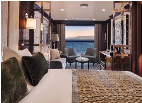
Retreat to spacious staterooms and suites