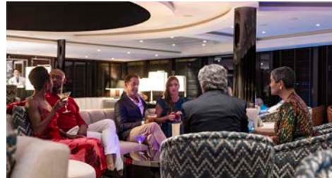
Enjoy casual conversation with new friends