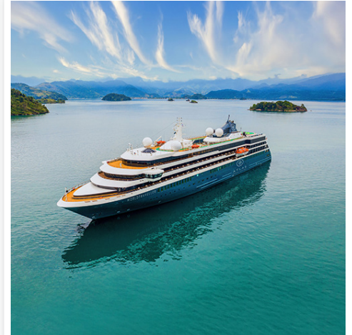
Sail along stunning waters and coastlines