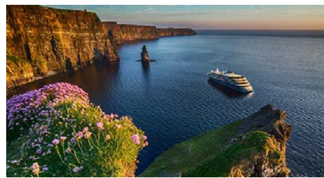
Delight in breathtaking landscapes