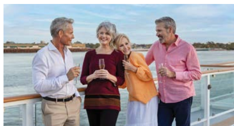
Enjoy casual conversation with new friends