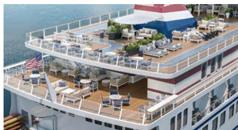
Relax on the top level sun deck