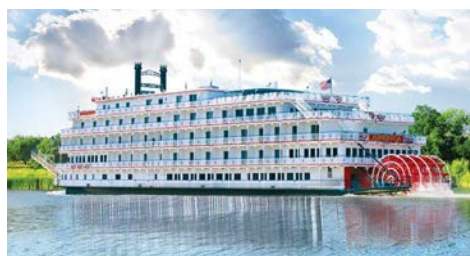
Sail on an traditional paddlewheeler