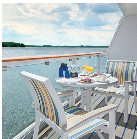
Savor breakfast on your private balcony