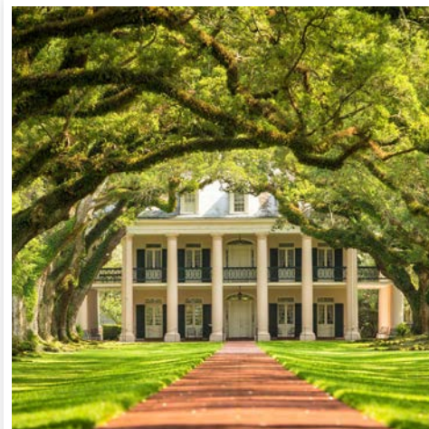
Visit a historic oak grove during a Mississippi River Cruise