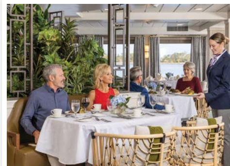
Relish modern American cuisine

Extolling spacious staterooms, private furnished balconies and luxurious amenities, discover the enchanting waterways, charming small towns and gracious ports on an authentic American river cruise. Follow in the paths of the pioneers with engaging and historic itineraries, unsurpassed service and the finest cuisine aboard the modern fleet of world-class riverboats, paddlewheelers and small cruise ships of American Cruise Lines. Savor a personalized experience with a maximum of 180 guests across Alaska, Columbia and Snake Rivers, Puget Sound, Mississippi River, New England and the Southeast. Together with the Journese® premier portfolio featuring all classes of air service, private transfers or car rentals, activities including private options and pre- and post-cruise stays, your enticing voyage awaits.