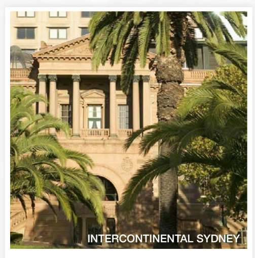
Escape to historical accommodations