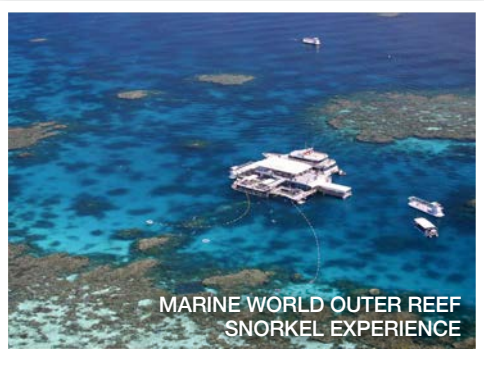
Snorkel with tropical fish over colorful coral

Experience it all along the beautiful coasts and outback of Australia. From pristine beaches with golden sands, the Great Barrier Reef teeming with tropical marine life and incredible wildlife to the wilderness of Tasmania, harbor cities of Sydney and Melbourne, and the vast red center of the country. The Journese® premier portfolio offers discerning travelers all classes of air service, luxurious four- and five-star resorts, car rentals or private transfers, immersive activities including private options and mini-packages on Kangaroo Island for spectacular getaways to this wondrous land Down Under.