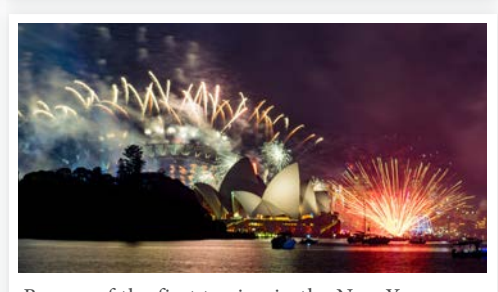
Be one of the first to ring in the New Year