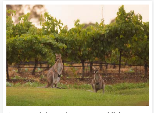
Sip wine while watching native wildlife

There is nothing like Australia. From gorgeous coastlines, pristine islands and the stark rugged beauty of the outback to countless wine regions, lush rainforests, marine treasures in the Great Barrier Reef, the world's oldest culture and chic, modern cities, there are so many unique experiences for discerning travelers to discover. Together with the Journese® elite portfolio offering all classes of air service, luxurious four- and five-star resorts, car rentals or private transfers, immersive activities including private options and mini-packages, its time to make your vacation to the land Down Under a reality.