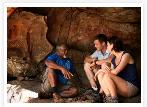
Hear stories about the world's oldest culture

UNIQUE EXPERIENCES IN THE LAND DOWN UNDER