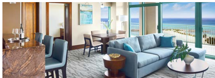
Luxurious suites and amenities