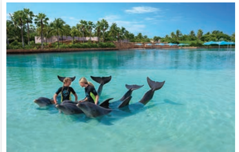
Educational marine life experiences