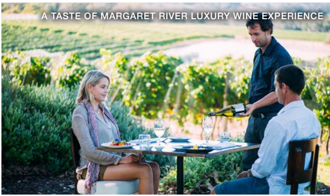
A TASTE OF MARGARET RIVER LUXURY WINE EXPERIENCE