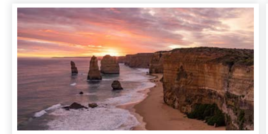
Twelve Apostles, Victoria

Endless possibilities abound in Australia – from exotic wildlife and Outback adventures to exhilarating city life and breathtaking backdrops. Swim through the colorful underwater world of the Great Barrier Reef, learn about Indigenous culture at Uluru, relish the world-class cuisine and mesmerizing architecture of Sydney/Warrane or stroll through the spectacular parks and laneways in Melbourne/Narrm. From nature to cosmopolitan adventure, Journese® offers an elite portfolio from coast to coast including exquisite four- and five-star resorts, all classes of air service, private transfers, immersive activities including private excursions, extended tour options, and luxury voyages aboard Windstar Cruises and Norwegian Cruise Line. Your vacation to Down Under awaits.