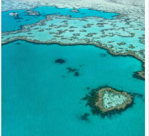
Great Barrier Reef, Queensland