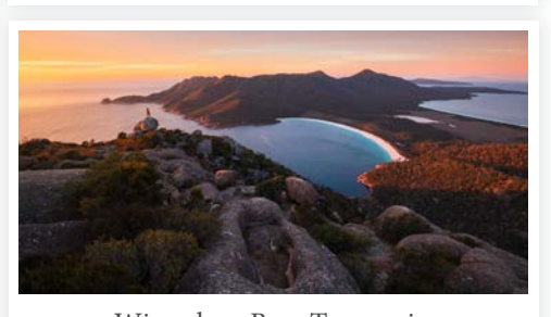
Wineglass Bay, Tasmania

The Luxury Brand of Pleasant Holidays | JOURNESE.COM