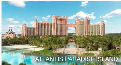
ATLANTIS PARADISE ISLAND

Enjoy nonstop fun at this Paradise Island gem