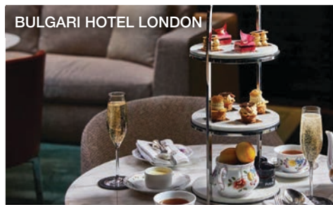
BULGARI HOTEL LONDON

Savor a traditional afternoon tea experience