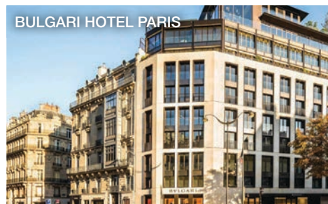
BULGARI HOTEL PARIS

Savor a traditional afternoon tea experience