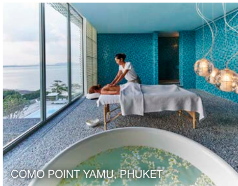
COMO POINT YAMU, PHUKET

Replenish mind, body and soul with a yoga class