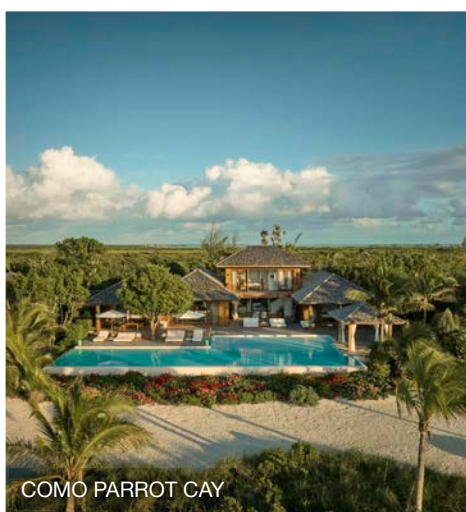
COMO PARROT CAY

Relax in the seclusion of an overwater villa