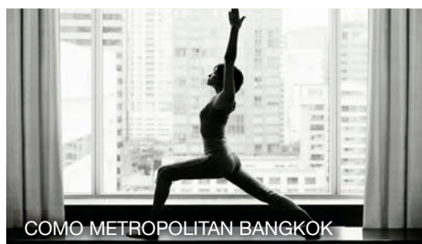
COMO METROPOLITAN BANGKOK

Indulge in the spaciousness of your luxurious suite