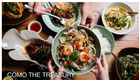
COMO THE TREASURY

Engage in unique marine activities with your resident expert