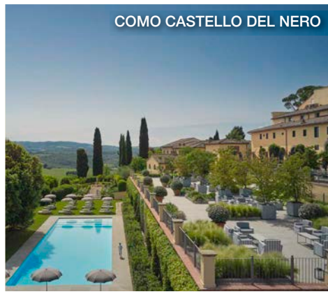
COMO CASTELLO DEL NERO