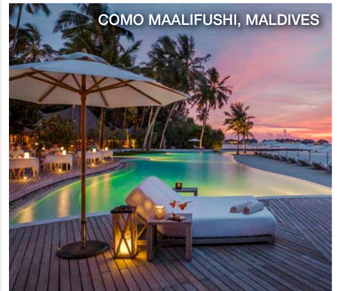
COMO MAALIFUSHI, MALDIVES

EXPLORE COMO HOTELS AND RESORTS ACROSS THE JOURNESE PORTFOLIO & ASK ABOUT ADDITIONAL RESORTS COMING SOON.