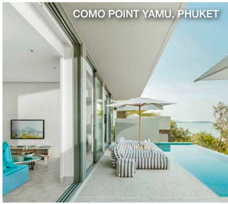
COMO POINT YAMU, PHUKET