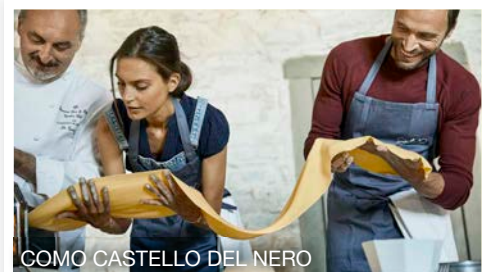
COMO CASTELLO DEL NERO

Be pampered with a revitalizing spa treatment