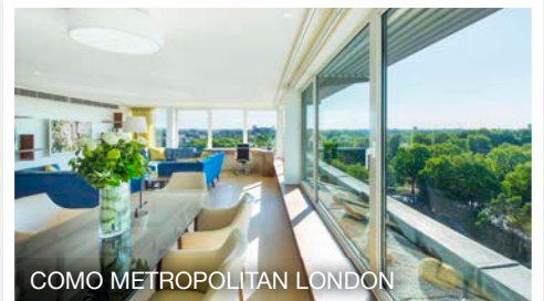
COMO METROPOLITAN LONDON

Indulge in the spaciousness of your luxurious suite