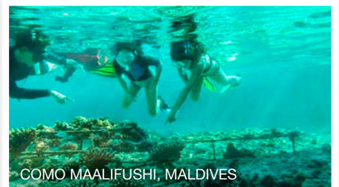
COMO MAALIFUSHI, MALDIVES

Retreat to the ultimate privacy in a residence