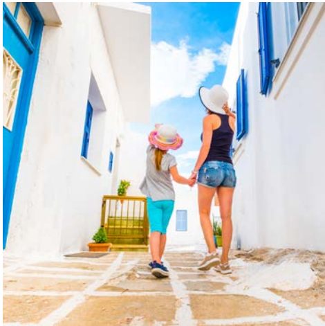
Stroll the quaint streets of Mykonos