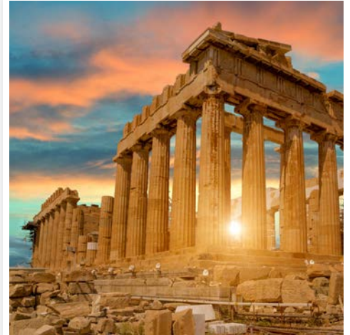
Explore the ancient ruins of Athens