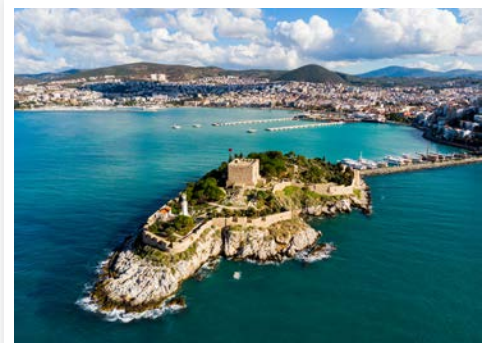
Visit the stunning marina in Kusadasi

Celebrate ancient history, rich traditions and dazzling modern life in the enthralling destinations of Greece, Egypt and Türkiye as you cruise under the stars of the sparkling seas of the Mediterranean aboard the new Celestyal Journey . Savor each heavenly night in all-inclusive luxury, featuring divine Dream Suite sanctuaries, scintillating gastronomy, endless pampering and lively entertainment. Experience engaging itineraries and authentic escorted excursions in time-honored ports of call, discovering the Greco-Roman and Byzantine past, stunning landscapes and archeological wonders, fine wines, local cuisines and more for an unforgettable odyssey.