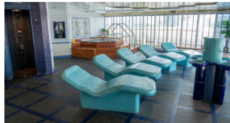
Be pampered at Drift Den and Thermae