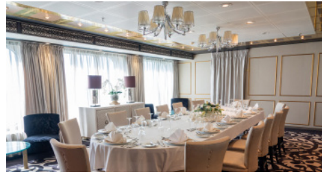
Enhance your dining experience at the Chef's Table