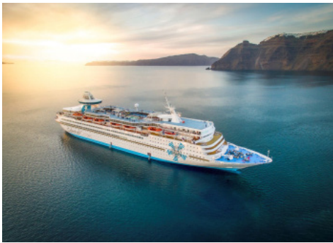
Experience renewed luxury aboard Celestyal Journey

THE NEWEST ADDITION TO THE JOURNESE® CRUISE PORTFOLIO