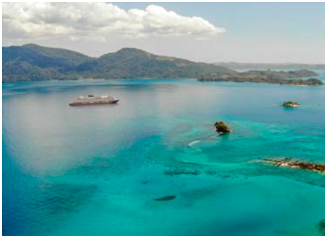
Experience a generous all-inclusive experience

THE NEWEST ADDITION TO THE JOURNESE® CRUISE PORTFOLIO