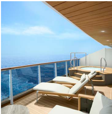
Relish endless views from your private balcony