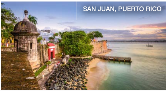
SAN JUAN, PUERTO RICO