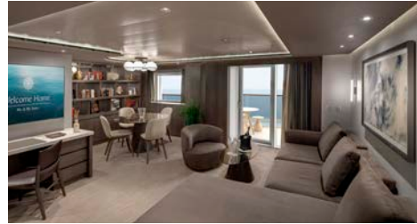
Retreat to elegant Homes at Sea