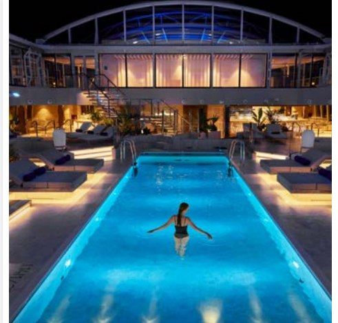
Enjoy languid days and nights onboard