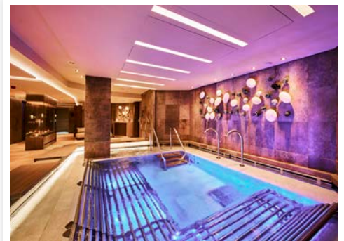
Replenish in the pampering wellness center

Discover the Ocean State of Mind with luxury sailings aboard Explora Journeys featuring award-winning Homes at Sea that are elegant, comfortable and feature private sun terraces. Offering unrivaled service and personalized experiences, savor thoughtful cuisine, revitalize with the extensive Wellness Programme, embark on guided, immersive Destination Experiences and enjoy a large variety of classes and entertainment options. Committed to protect the oceans, lands and cultures, voyages connect you to the people and places you visit from celebrated destinations to less traveled spots. Together with the Journese premier portfolio offering pre- and post-cruise stays, Cruise Protection Plans, all classes of air service, private transfers and immersive excursions, the ultimate ocean escape is waiting aboard Explora Journeys .