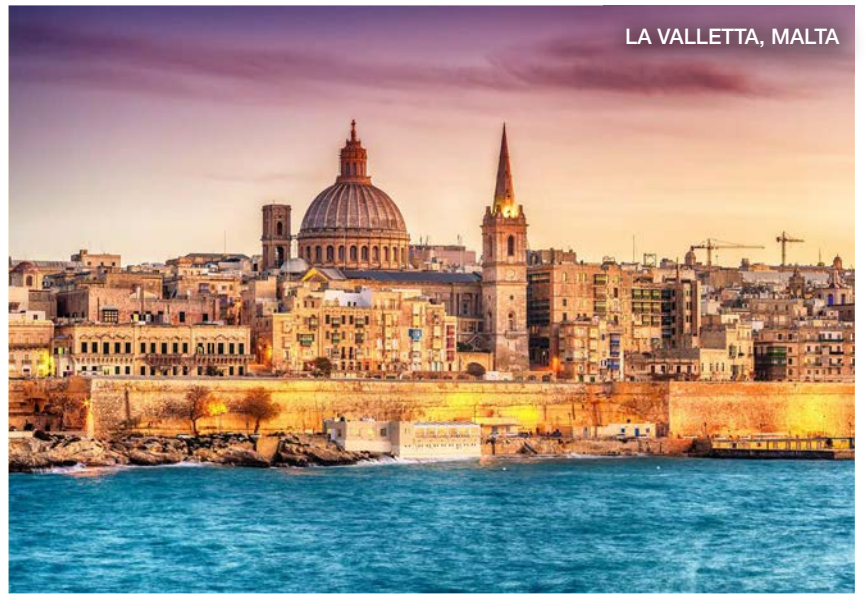
LA VALLETTA, MALTA

Below is a sample of an immersive itinerary: Grand Journey from Carib-Cool to Old World Legends with Explora Journeys. Visit Journese.com/itineraries or Journese.com/cruises for more options.