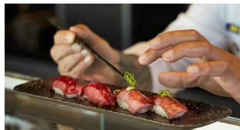
Savor artfully presented global cuisine