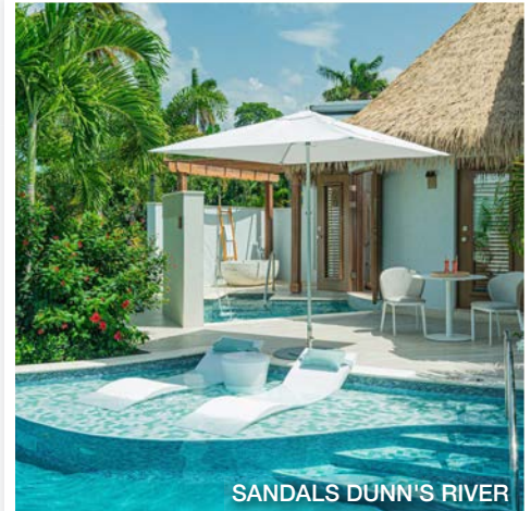
Escape to exquisite Rondoval suite options