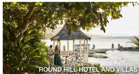
Reconnect with your loved one