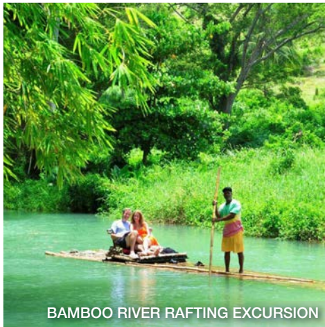
Replenish in natural beauty