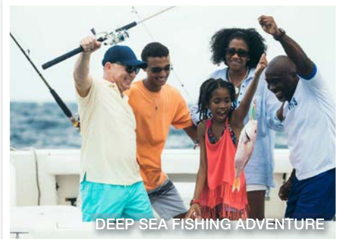
Embark on a thrilling excursion

Serene elegance, verdant landscapes and a melange of culture and art infused with the pulse of reggae, Jamaica is the ultimate getaway for families and couples alike. Delight in the famed Blue Mountains and Dunn's River Falls, the powdery-sand beaches of Negril, local craft markets, jerk chicken favorites and welcoming people. Explore the Journese® premier portfolio including all classes of air service, luxurious four- and five-star resorts, Private Retreat SM and villa options, private transfers, immersive activities and Club Mobay VIP arrival and departure service, for a memorable island escape.