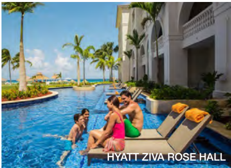
HYATT ZIVA ROSE HALL

Create cherished family in your swim-up suite