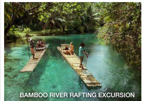
BAMBOO RIVER RAFTING EXCURSION

Retreat to your private resort residence with exquisite service and personal pool