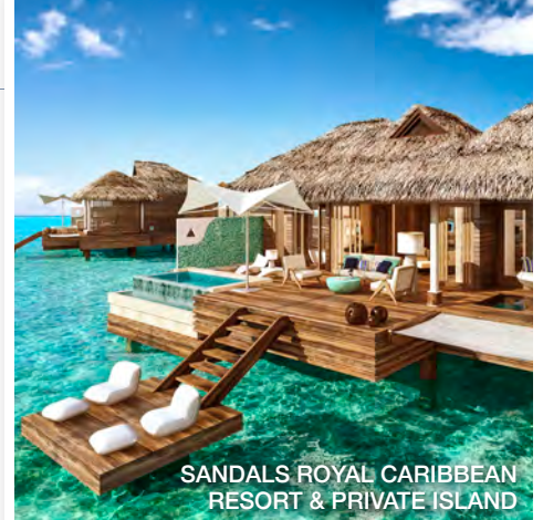
SANDALS ROYAL CARIBBEAN RESORT & PRIVATE ISLAND

Escape to exquisite overwater bungalow options