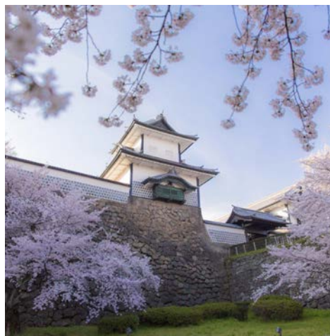
Explore renowned castles and their gardens