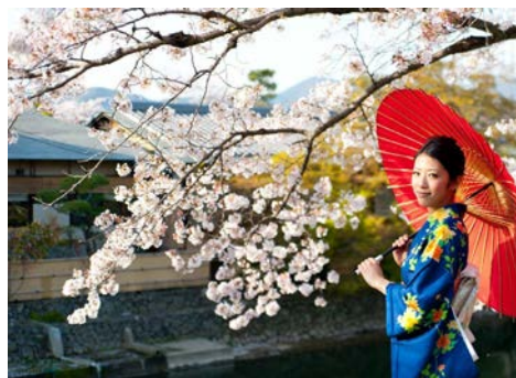
Learn about a unique culture and local traditions