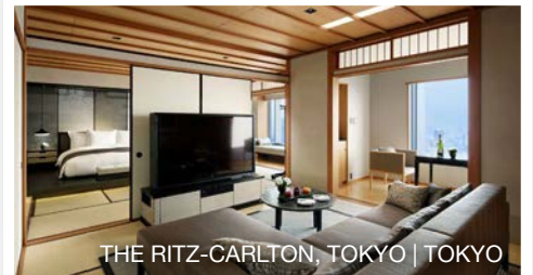
THE RITZ-CARLTON, TOKYO | TOKYO