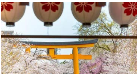
Immerse in the beauty of a historical city