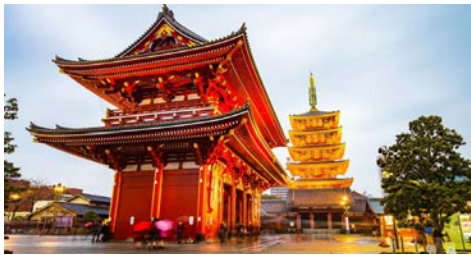
Visit ancient Buddhist temples and Shinto shrines

BEAUTY AWAITS DURING CHERRY BLOSSOM SEASON