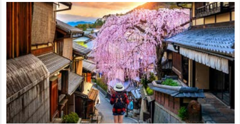
Stroll the streets of beautiful cities