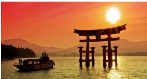
Marvel at breathtaking sunsets over iconic gates