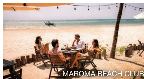
MAROMA BEACH CLUB

Reconnect with friends in beachside bliss