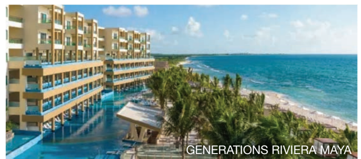
GENERATIONS RIVIERA MAYA

Spend long, lazy days on powdery soft sands