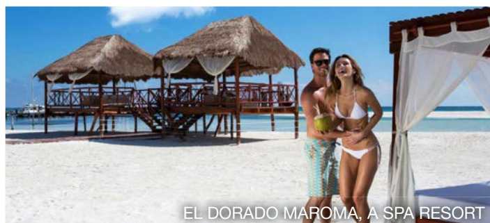
EL DORADO MAROMA, A SPA RESORT

Spend long, lazy days on powdery soft sands