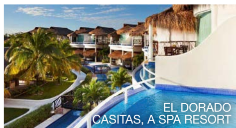
EL DORADO CASITAS, A SPA RESORT

MORE INCLUSIVE GETAWAYS WITH LOMAS HOSPITALITY