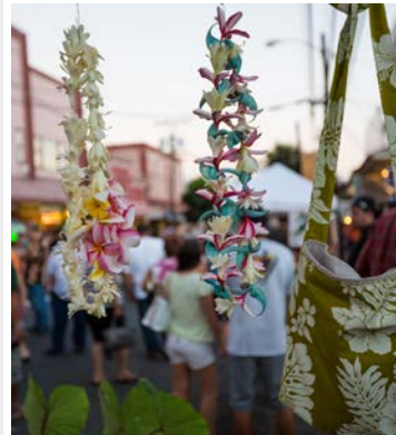
Attend a local event for traditional crafts and goods