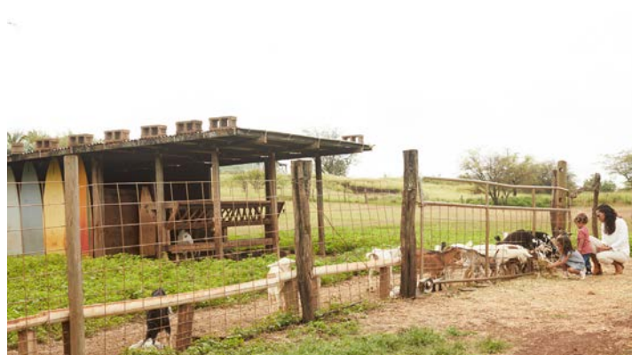
Explore the farms, plantations and fields in Upcountry Maui, many offering culinary experiences and tours