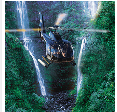
Soar above the island's beauty