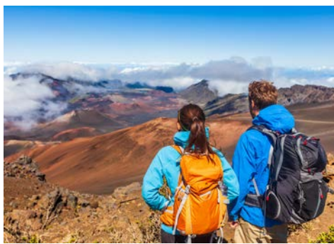
Savor the stunning views at Haleakala

LET THE MAGIC UNFOLD: SPECIAL RATES & DAILY BREAKFAST