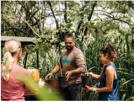
Participate in a volunteer experience