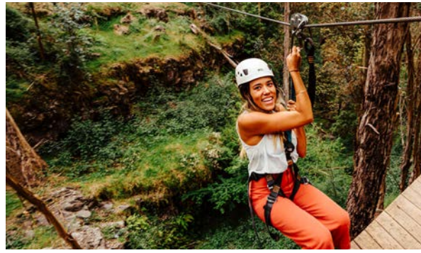
Delight in a thrilling zipline adventure