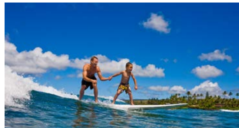
Embark on a new family adventure