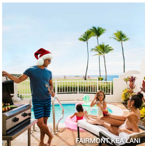
FAIRMONT KEA LANI