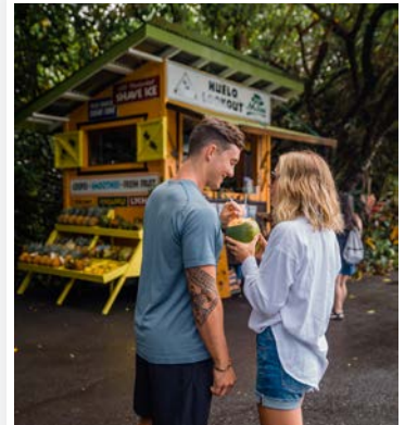
Savor home-grown favorites at a road side stand