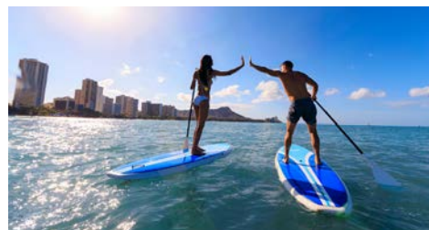
Combine your Maui stay with a stay on Oahu, Kauai or the Big Island for the ultimate getaway