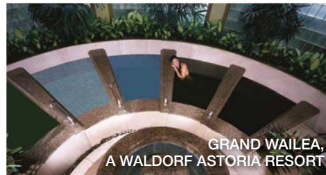
GRAND WAILEA, A WALDORF ASTORIA RESORT