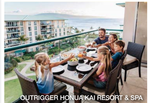
OUTRIGGER HONU KAI RESORT & SPA