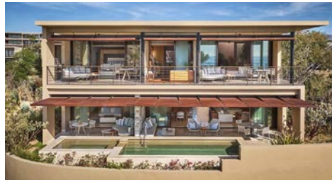
Retreat to spacious accommodations