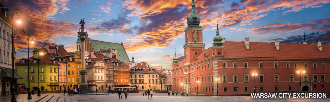
WARSAW CITY EXCURSION