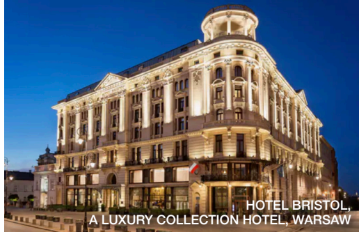
HOTEL BRISTOL, A LUXURY COLLECTION HOTEL, WARSAW