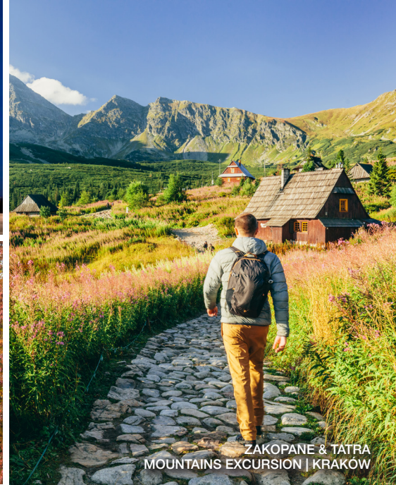
ZAKOPANE & TATRA MOUNTAINS EXCURSION | KRAKÓW