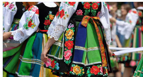
Uncover the delights of the local culture