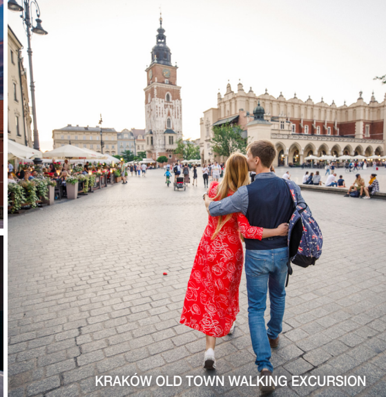
KRAKÓW OLD TOWN WALKING EXCURSION

Below is just a sample of the immersive itineraries our Destination Specialists can create. Visit Journese.com/itineraries for more options.