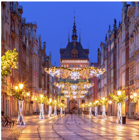
Visit during the holidays for beautiful décor