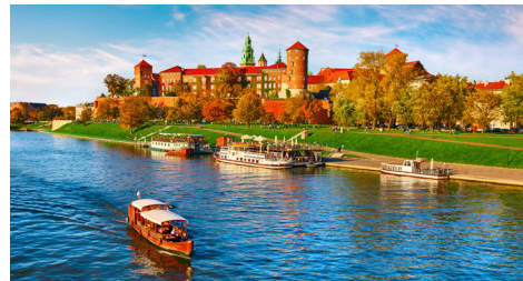
Learn the history of Wawel Royal Castle in Kraków