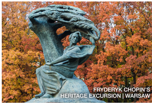
FRYDERYK CHOPIN'S HERITAGE EXCURSION | WARSAW