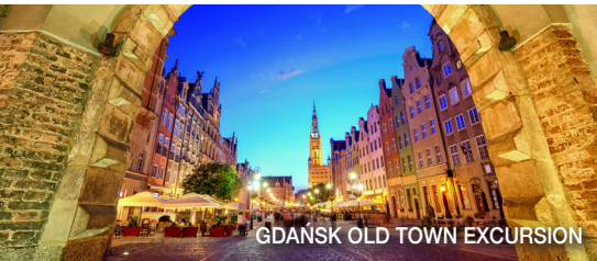
GDAŃSK OLD TOWN EXCURSION