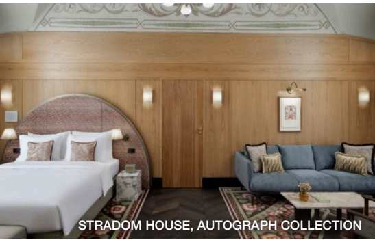
STRADOM HOUSE, AUTOGRAPH COLLECTION