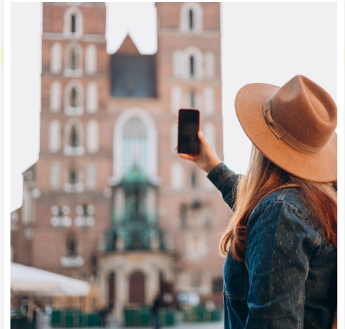
Spend the day exploring historical landmarks in Warsaw