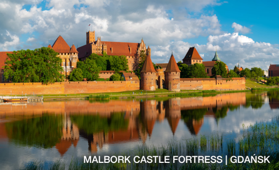
MALBORK CASTLE FORTRESS | GDAŃSK