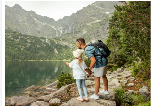
Explore the stunning Zakopane & Tatra Mountains

A parliamentary republic nestled in the heart of Europe and along the shores of the Baltic Sea, discover a welcoming country steeped in a confluence of thriving modern life and reverent history, with rich cultural heritage and traditions. Delight in tantalizing cuisines, diverse landscapes, enchanting medieval architecture and bustling old towns in colorful metropolises including Gdańsk and Krakow, and capital city of Warsaw, its Royal Route, triumphant post-war honors and love of Chopin. A country ideal for outdoor enthusiasts, history followers, and culture devotees, enjoy the Journese ® premier portfolio with all classes of air service, private transfers, immersive experiences and signature services.