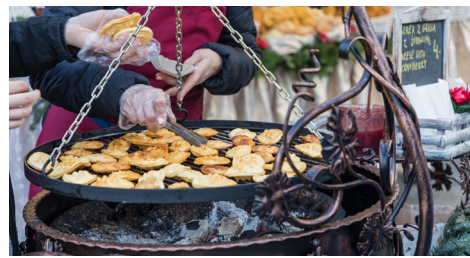
Sample pierogies , a Polish delicacy