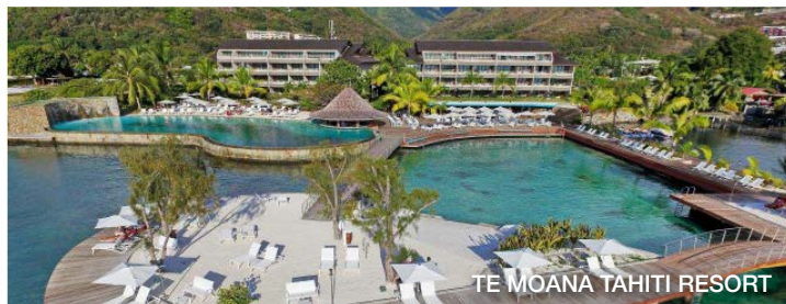
TE MOANA TAHITI RESORT

Relax in lagoon-style pools with easy ocean access