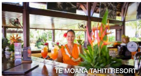
TE MOANA TAHITI RESORT