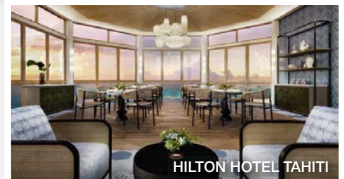
HILTON HOTEL TAHITI