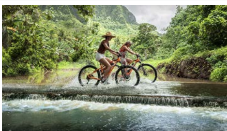
Discover the island's lush landscapes