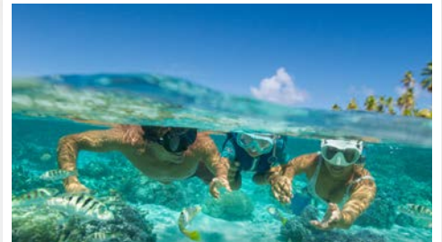
Embark on a new family adventure in crystal-clear waters