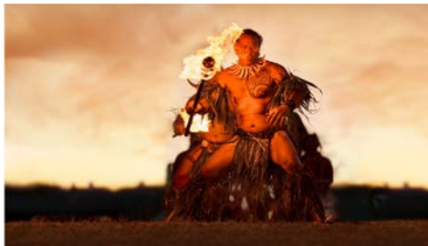
Delight in local history and culture