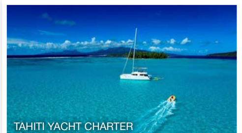
TAHITI YACHT CHARTER