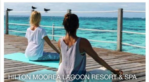
HILTON MOOREA LAGOON RESORT & SPA