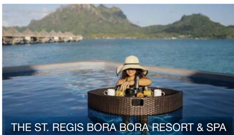
THE ST. REGIS BORA BORA RESORT & SPA