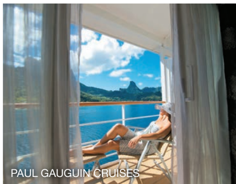
PAUL GAUGUIN CRUISES