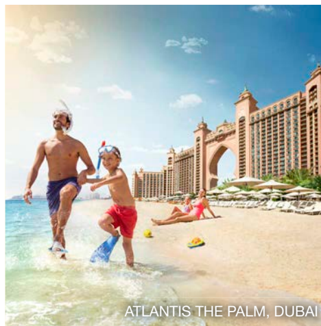
ATLANTIS THE PALM, DUBAI