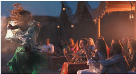
Delight in the entertainment of a new culture