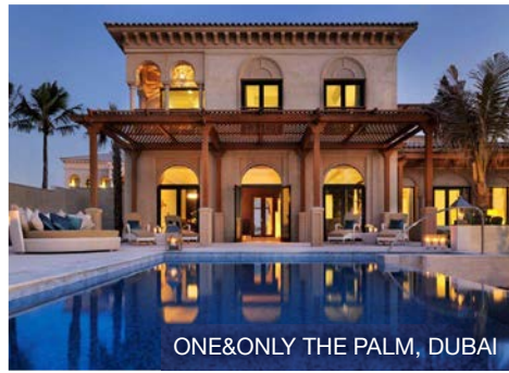
ONE&ONLY THE PALM, DUBAI