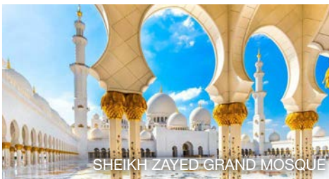
SHEIKH ZAYED GRAND MOSQUE