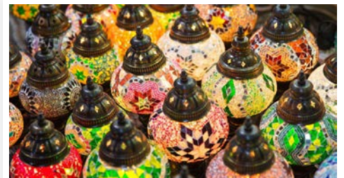
Uncover unique treasures in souks and markets

Mesmerizing and futuristic, experience a captivating country filled with endless possibilities. Discover ultra-modern cityscapes, lavish royal fortresses, mega-shopping malls, pristine beaches and man-made islands, combined with rich cultural heritage and ancient tribal traditions. With the Journese premier portfolio offering more than 25 luxurious four- and five-star resorts, all classes of air service, private transfers, immersive activities including private options and the ability to combine your Dubai or Abu Dhabi vacation with another destination, your unforgettable United Arab Emirates journey awaits.