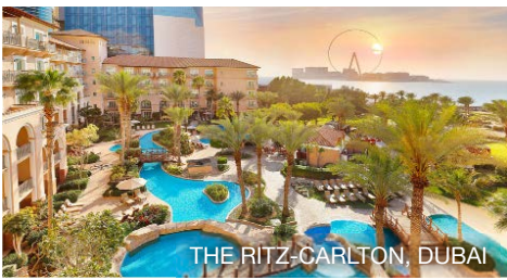
THE RITZ-CARLTON, DUBAI