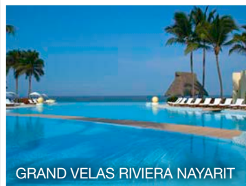
GRAND VELAS RIVIERA NAYARIT

Spend long, lazy days by the sparkling pool