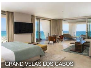
GRAND VELAS LOS CABOS

GRAND VELAS RESORTS: BEYOND ALL-INCLUSIVE, BEYOND ALL COMPARE™