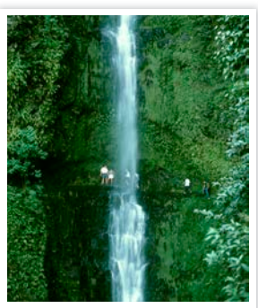
Island of Hawaii | Kohala Waterfall Adventure