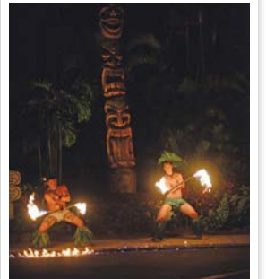
Maui | Royal Lahaina Luau