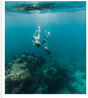
Island of Hawaii | Morning Snorkel & Sail