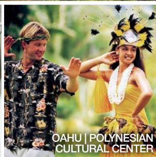
The Luxury Brand of Pleasant Holidays