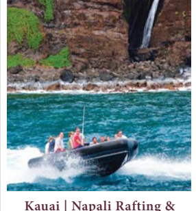
Kauai | Napali Rafting & Snorkel Adventure