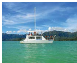
Oahu | Kualoa Ranch Experience