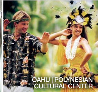
OAHU | POLYNESIAN CULTURAL CENTER