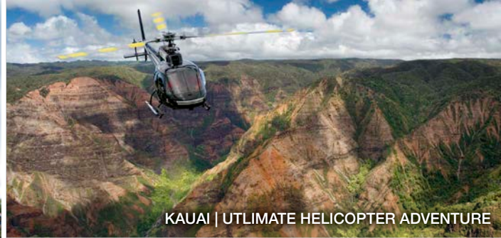
KAUAI | ULTIMATE HELICOPTER ADVENTURE