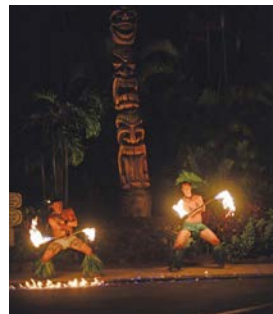
Maui | Royal Lahaina Luau