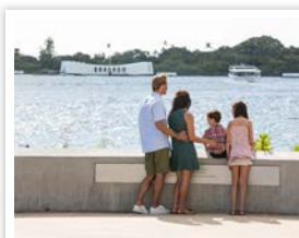
Oahu | Pearl Harbor, Arizona & Punchbowl