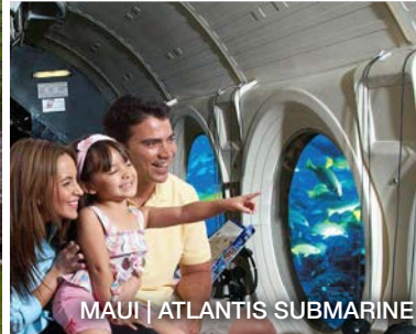
MAUI | ATLANTIS SUBMARINE