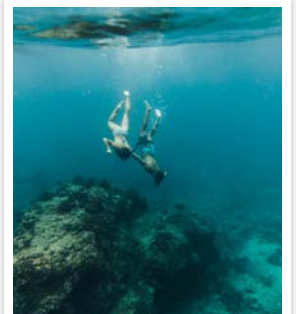
Island of Hawaii | Morning Snorkel & Sail