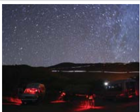
Island of Hawaii | Mauna Kea Sunset & Stargazing