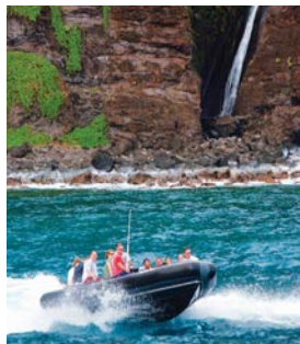
Kauai | Napali Rafting & Snorkel Adventure