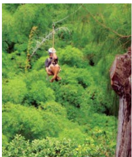
Kauai | Kipu Falls Zipline Safari

Here is a small sample of the many activities our Destination Specialists can pre-book for you. Scan the QR code or visit Journese.com/experiences for a complete list of excursions, pricing and descriptions.