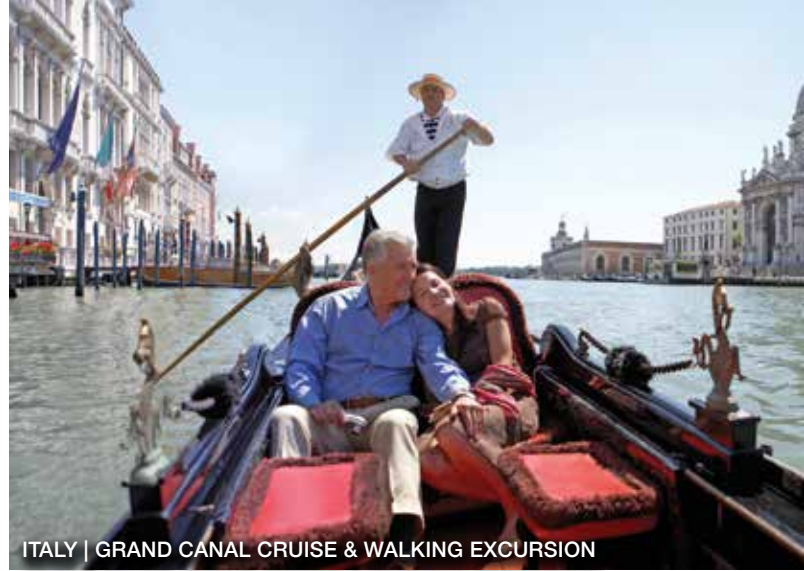
ITALY | GRAND CANAL CRUISE & WALKING EXCURSION