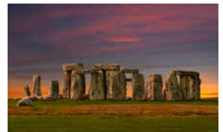
England | Windsor, Stonehenge & Bath