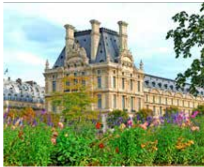
France | The Louvre Museum