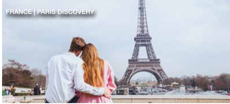
FRANCE | PARIS DISCOVERY