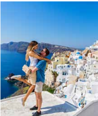
Greece | Akrotiri Excavations & Traditional Village of Oia