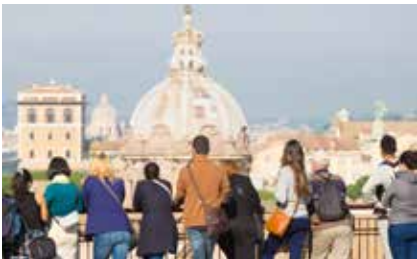
Italy | Rome Highlights & Colosseum