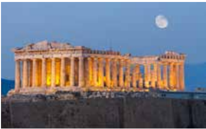
Greece | Ancient Athens

HERE IS A SAMPLE OF THE MANY ACTIVITIES OUR DESTINATION SPECIALISTS CAN PRE-BOOK FOR YOUR CLIENTS. VISIT JOURNESE.COM/EXPERIENCES FOR A COMPLETE LIST OF EXCURSIONS.