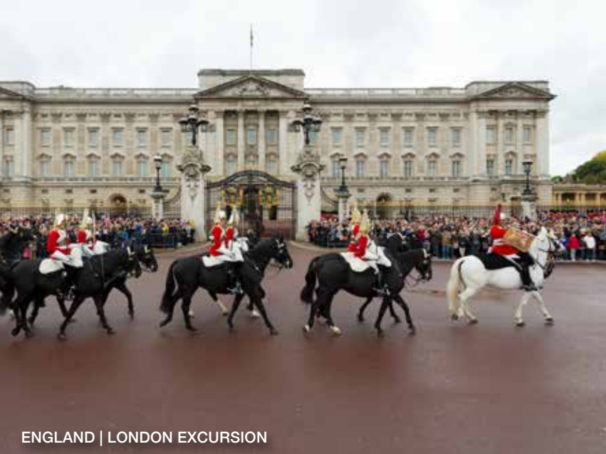
ENGLAND | LONDON EXCURSION