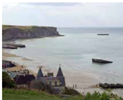
France | Normandy: Beaches of D-Day