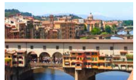
Italy | Classical Florence