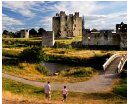
Ireland | Boyne Valley Excursion