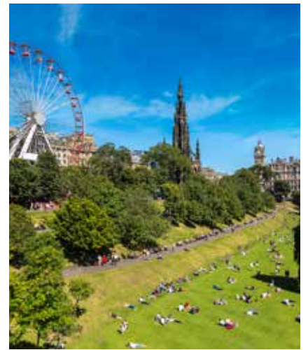
Scotland | Edinburgh City Excursion